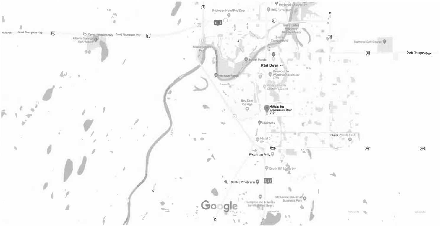
1 km