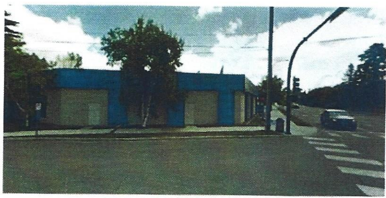
5108 49 Ave Innisfail, AB T4G 1R1