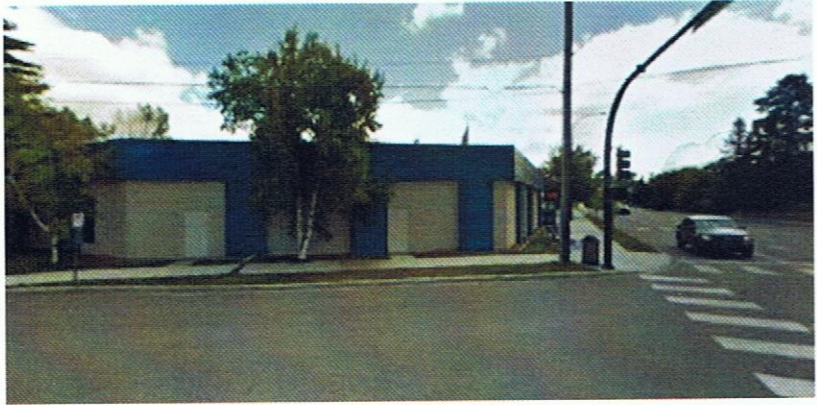
5108 49 Ave Innisfail, AB T4G 1R1